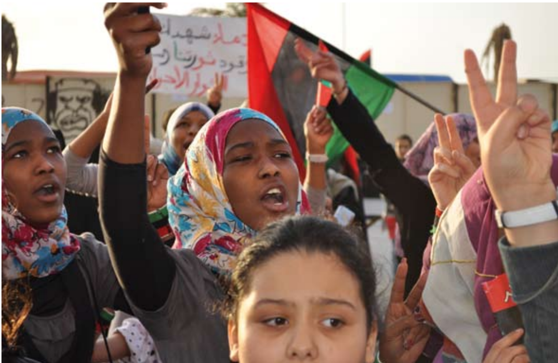
Libyan youth calls for freedom.

Creative cooperation: Given the nature of the revolution and the cultural starvation of the Libyan people, there is a clear need for creative cooperation at many levels, such as between music (hip hop, rock and other music styles), caricature, graffiti or other popular art forms. The revolution is being expressed through many creative channels, and the new freedom is literally water in a desert.