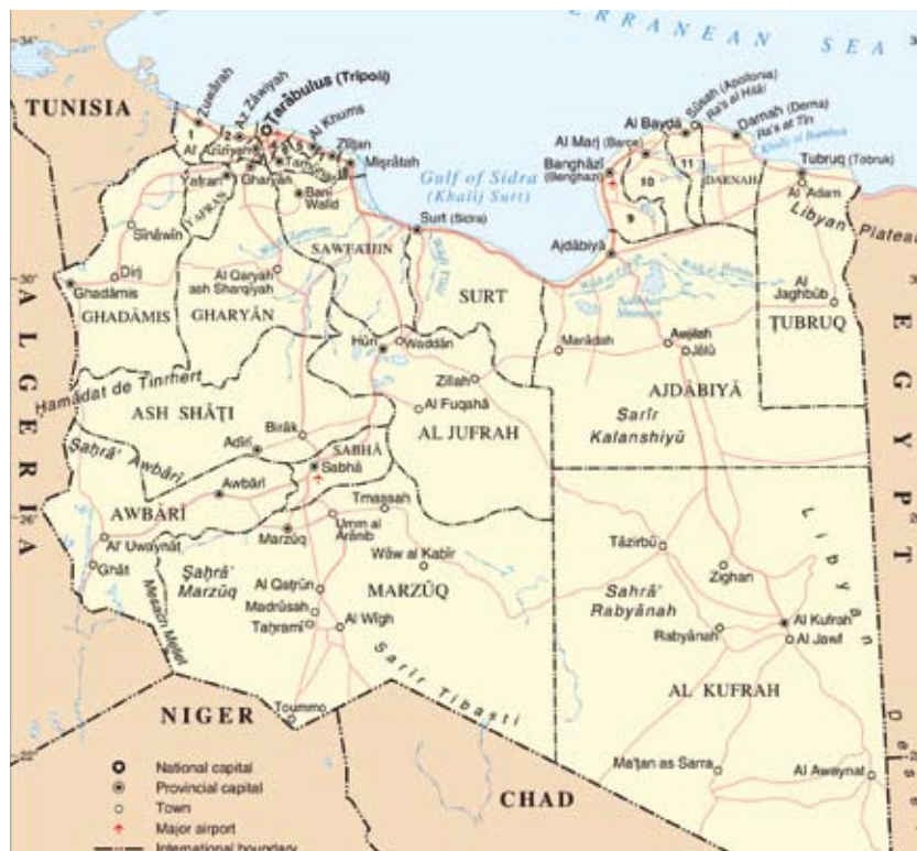
Map of Libya.

This report provides a snapshot of the media landscape as it stands this summer, 2011.