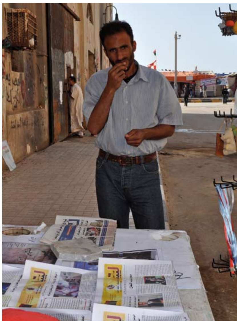
Newspaper salesman.

Libya February 17th was the first independent newspaper to be published in the liberated areas of Libya. The first issue was already on the streets by 24 February, one week after the beginning of the uprising and before the establishment of the LTC and was therefore not required to apply for a media license. Libya February 17th has the traditional layout of a newspaper and a circulation of around 7000 copies, which is relatively high in comparison to other papers. The premises of the newspaper are located in the Independent Media Centre.