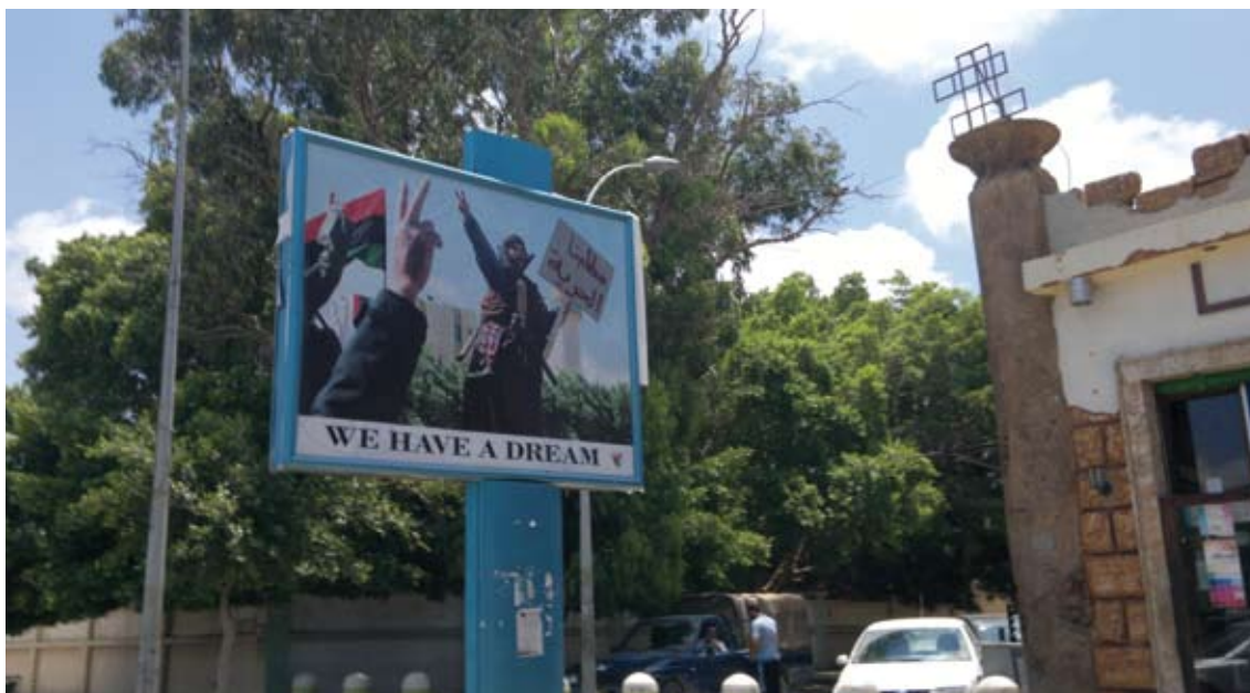
From the streets of Benghazi, Libya, June 2011.

concrete business models, which will keep new media outlets afloat in the long term. Some media actors also highlighted the lack of an independent printing facility as a challenge as well as a fear of the old mentality of controlling the media manifesting itself in the media environment.